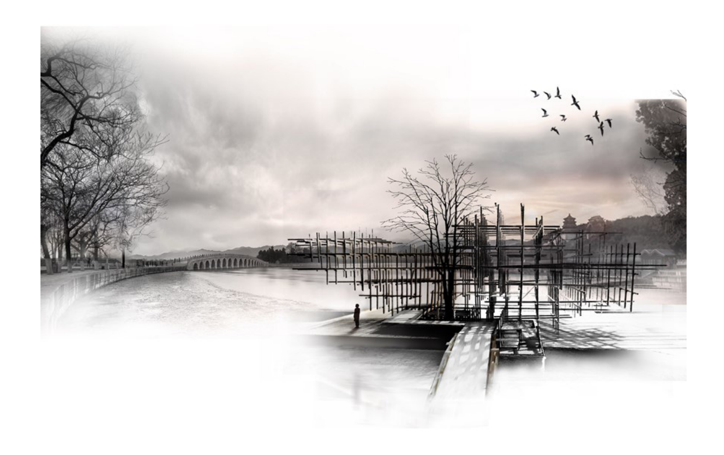
Figure 3. The Cloud Pavilion, an informal spiritual space in the Garden of the Summer Palace ( Yiheyuan 颐和园), Beijing. Designed, materially modeled, and digitally drawn by author, 2019

The design concept of informal spiritual space can also be developed by alluding to historical allegories of religious symbolism. Three iconic Daoist symbolisms in Chinese culture: "Debate on the Happiness of Fish" (yule 鱼乐), "Hermit in Between" (zhongyin 中隐)³, and "Peripateticism" (xiaoyaoyou 逍遥游) (Zhuangzi, p. 13, pp. 268-269; Yang, pp. 38-39), for example, can be chosen as historical allusions for designing architectural gestures of contemplation: "gazing at a scene," "sitting in silence" and "wandering in absolute freedom." Alluding to the three Daoist symbolisms, the structure of informal spiritual space acts like a labyrinth, providing multiple possibilities for gazing, sitting, strolling, and meditating, the socalled moment of the "condensation of mind"