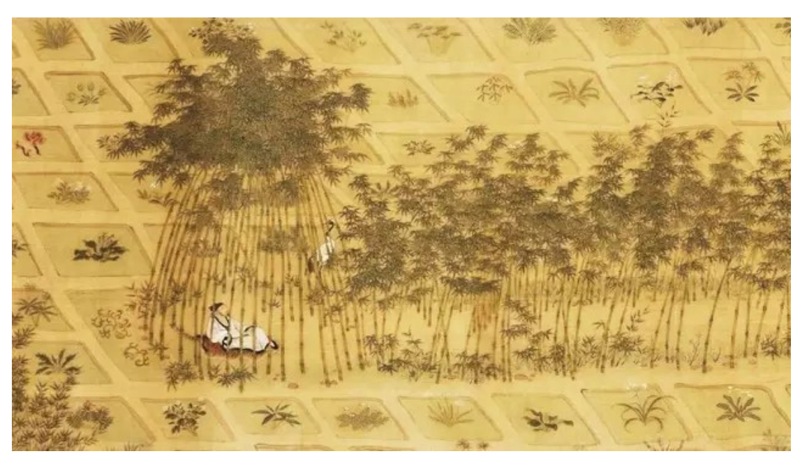
Figure 1. The painting of "the Garden for Solitary Enjoyment" ( Duleyuan 独乐园) (partial view) depicts the Song-dynasty scholar Sima Guang's 司马光 contemplation in an informal spiritual space. Painted by Qiu Ying 仇英, 1515-52. Collected by the Cleveland Museum of Art.

Without rigorous schedules and formal rituals, informal spiritual spaces can create a free and easily accessible atmosphere for pursuing spiritual enlightenment. It allows people to re-examine the relationship between human existence and the spiritual world.