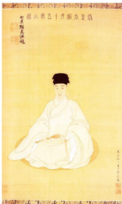
Figure 6. Zeng Jing, Portrait of Wang Shimin at the age of 20 (1616).

The similarities of this painting with Cuzco paintings can be explained by the availability of Mexican paintings in China since 1578, and the circulation of European prototypes within Jesuit missions throughout the four continents (Bailey, 1999, p. 93 and Curvelo, 2018, p. 63).