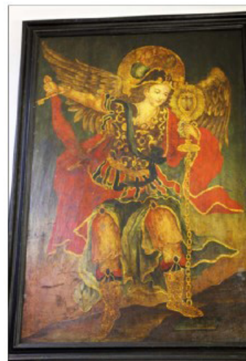
Figure 5. Archangel Saint Michael, oil on canvas, after 1614 (n.d.).

Jesuit painting in China between the late 16th and the first half of the 17th century was part of the Jesuit global mission operating simultaneously on four continents. According to Gauvin Alexander Bailey, the leading scholar on Jesuit missionary art, most oil paintings imported from Europe into China at the beginning of the 17th century were done by Italian painters. Flemish illustrated books and maps and loose engravings arguably were more influential than paintings. Their size and their relatively low price facilitated their circulation within and beyond the Jesuit missions (Bailey, 1999, pp. 91-92).