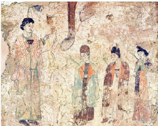
Figure 1. Murals from the Nestorian Temple at Qocho. (2019).