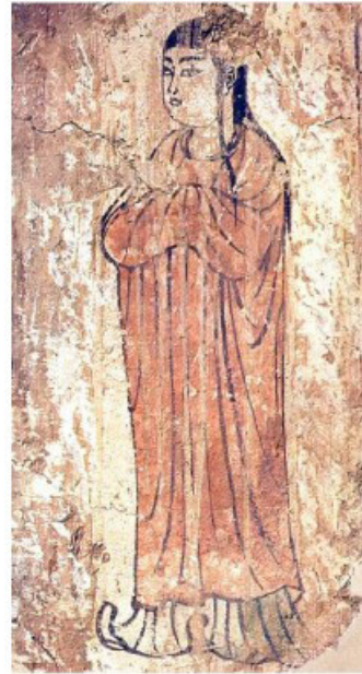
Figure 2. Murals from the Nestorian temple at Qocho. (2019).

Retrieved March 26, 2020, from https://en.wikipedia.org/wiki/Murals_from_the_Nestorian_Temple_at_Qocho