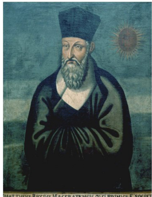
Figure 4. Matteo Ricci. (n.d.). Retrieved March 26, 2020, from https://pt.wikipedia.org/wiki/Matteo_Ricci#/media/Ficheiro:Ricciportrait.jpg

China constituted a well-known field for the Jesuit accommodation strategy. In their way of proceeding, the Jesuits relied on the apprehension and inclusion of certain aspects of China's cultures and spiritualities. They traced and explored similarities between Chinese and Western sacred rituals and iconographies. In 1598, the Italian Niccolò Longobardi S.J. (1565–1654) asked General Claudio Acquaviva for some images of the Blessed Virgin Mary. He argued that all Chinese, even the pagan people, shared a strong devotion to the Virgin Mary. Longobardi found evidence for this devotion in the fact that Chinese worshipped by kowtowing while repeating aloud “ Xian Mu Mian Mian ,” which he translated as “Holy Mother and Queen of the Queens” (Longobardi, 1598, F. 177v).